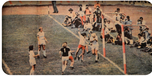
Mexico take the lead.