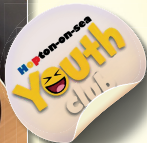
We had a great final night playing games, making and eating popcorn and candyfloss and eating ice cream cornets.

The Youth Club is currently closed for the summer holidays and plans to reopen Friday 27th September . Please join the Hopton Youth Club Facebook group to keep up to date with current opening times, events and closures.